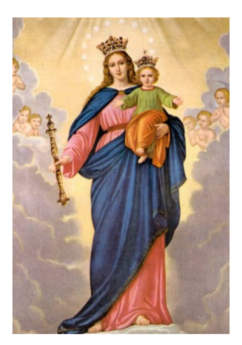
Entrustment of the Home to Mary Help of Christians

Most Holy Virgin Mary, appointed by God to be the Help of Christians, we choose you as the Mother and Protectress of our home.